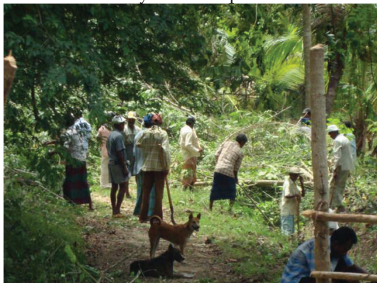
Figure 2 - Farmer community helping in canal clearing

The plan, heralded with much enthusiasm, exceeded the expectations in the implementation phase itself. The participation of the community was exceptional and the