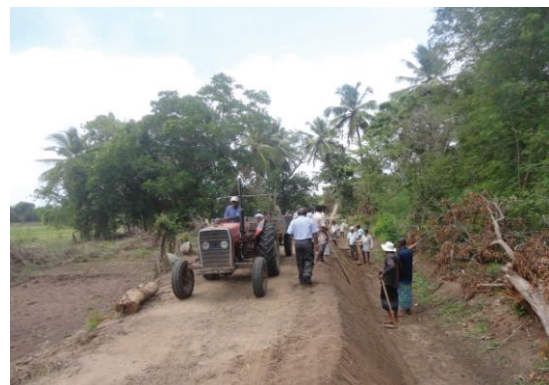
Figure 3 - Farmer community has progressed with canal clearing

It is observed that such levels of commitment towards the programme could be garnered primarily due to the fact that the opinions and ideas of the community were integrated into the creation and implementation of the livelihood support assistance plan from the outset. Consequently, it can be assumed that the community regarded this programme as a