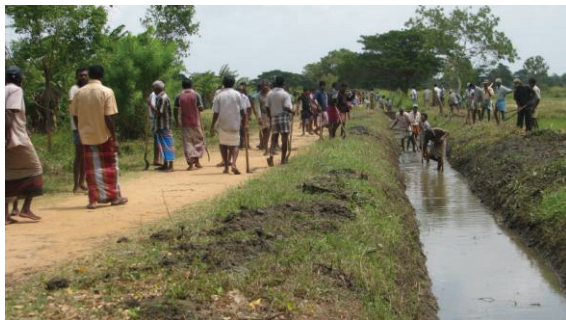
Figure 4 - Farmer community is setting out to work in canal clearing

The seeds and fertilizers were supplied by various stakeholder agencies including the Agrarian Services Department whose co-ordination with the farmers managed by the DSWRPP along with the support organizations.